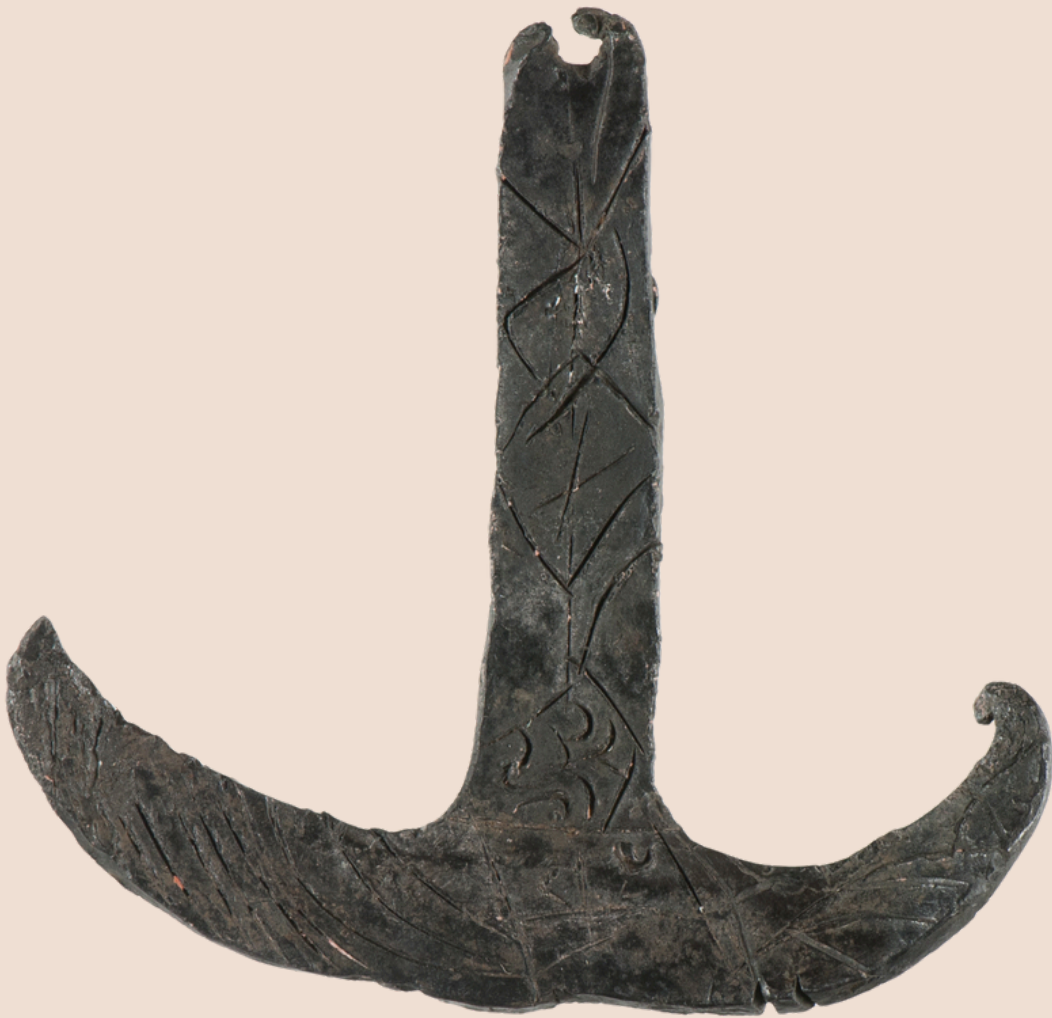
Image: A Viking pendant fashioned in the shape of a longboat.