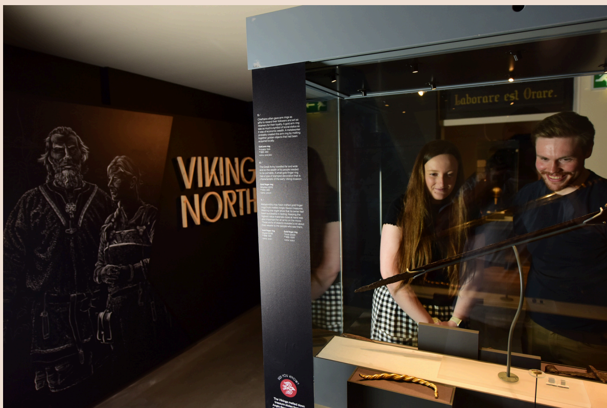
Image: Exploring the Viking North exhibition, courtesy of York Museums Trust.

You will be sent a copy of our Discover: Viking North Workshop Risk Assessment once a booking has been made.