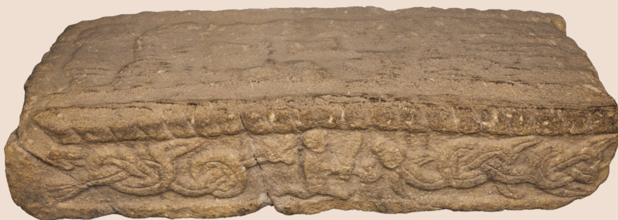
Image: A Viking grave cover which depicts the mythical Scandinavian hero Sigurd slaying the dragon Fafnir.

Your preferred object box and play-based activity can be selected during the booking process.