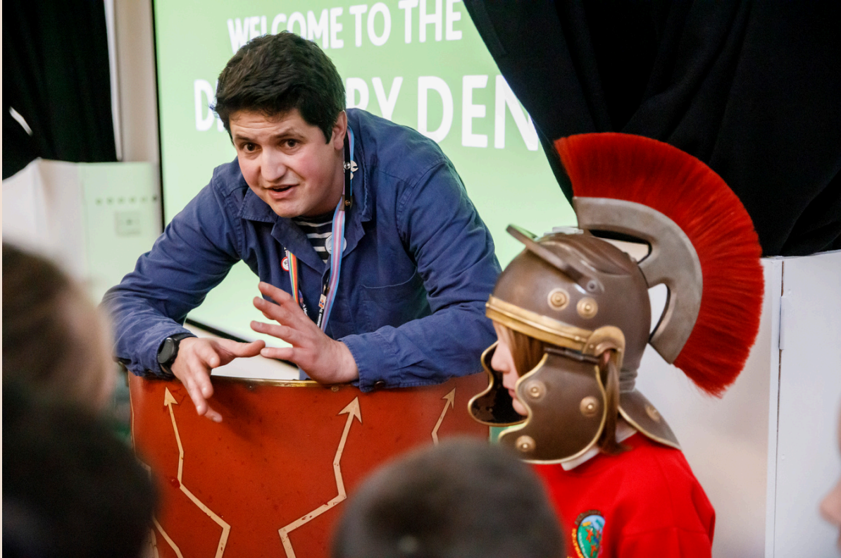
Image: Exploring Roman arms and armour at the Yorkshire Museum.

If you require further information about our Discover: Viking North workshop, or making a visit to the Yorkshire Museum, then please get in touch with our Learning Team at schools@ymt.org.uk or call 01904 650348 .