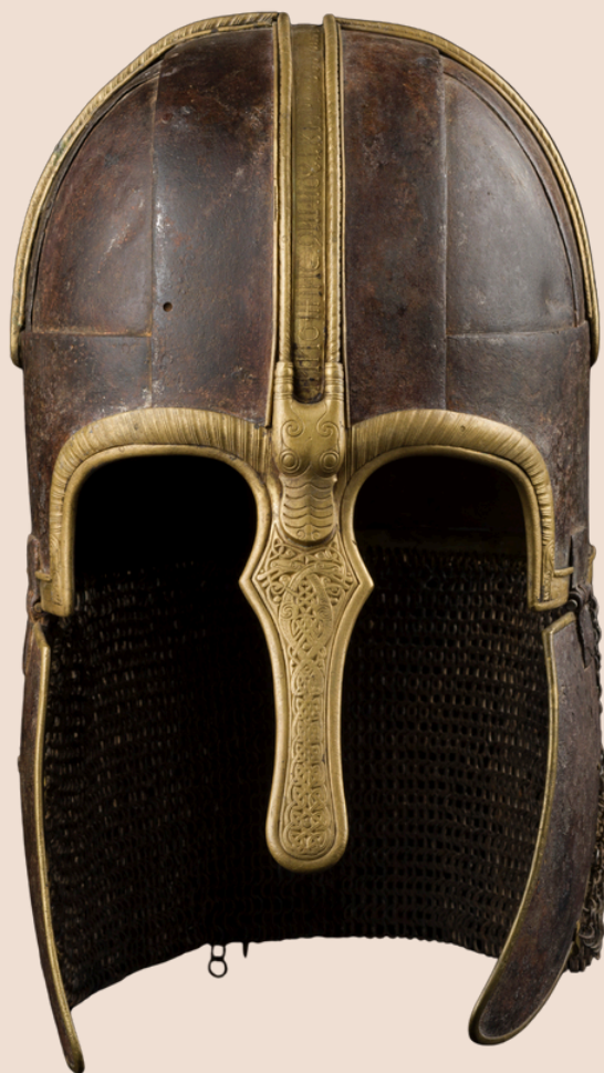
Image: The Coppergate Helmet. This finely decorated Anglo-Saxon helmet was hidden shortly before the Viking attack on York in AD 865.