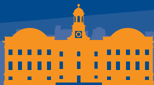
York Castle Museum