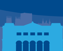
York Art Gallery